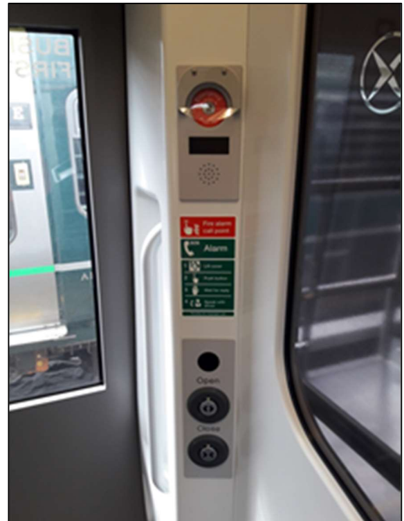
On board wheelchair accessible spaces and customer help points