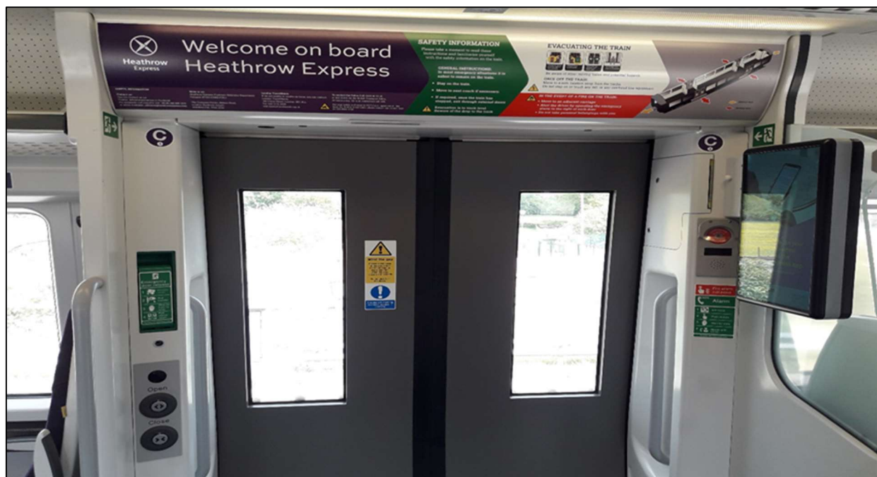
On board customer safety information